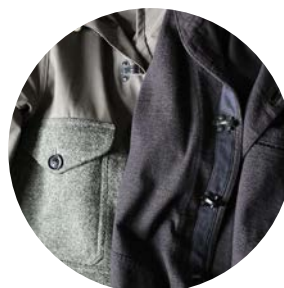
SOURCING SUSTAINABLE COTTON