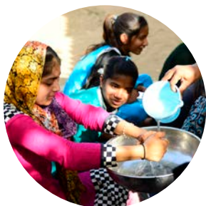
HEALTH AND EDUCATION