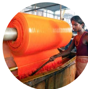
SUPPLY CHAIN LINKAGES