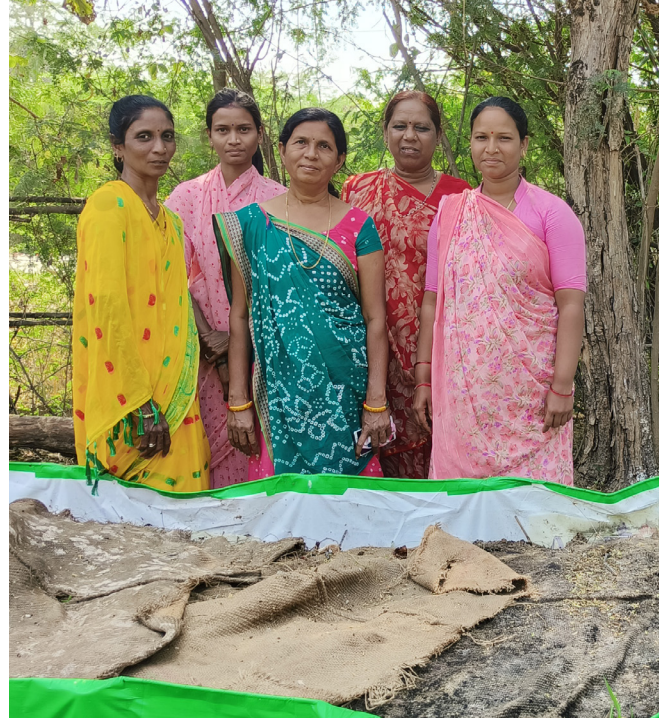
Women farmers from Vyadhar village, Narmada district, Gujarat in India with vermicompost production.

The uniqueness of the approach is driven by a mix of: